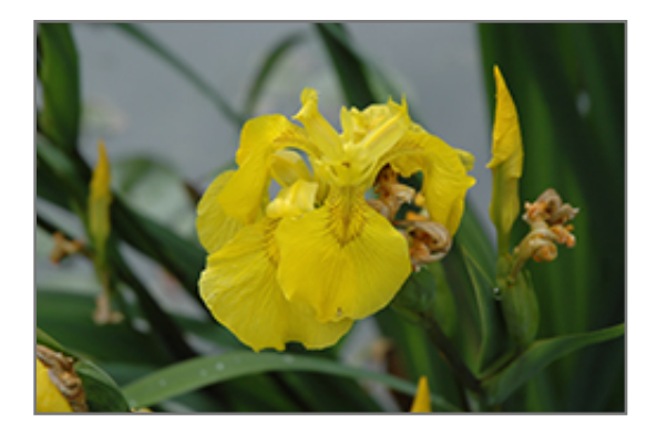
Yellow Flag Iris flowers