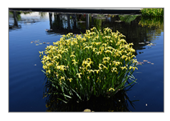
Yellow Flag Iris in bloom