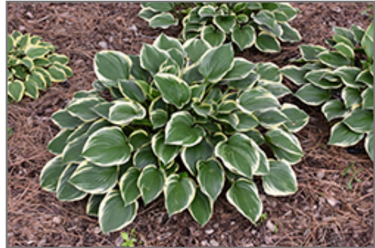
Torchlight Hosta

Torchlight Hosta is recommended for the following landscape applications;