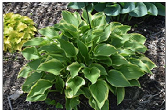
Torchlight Hosta