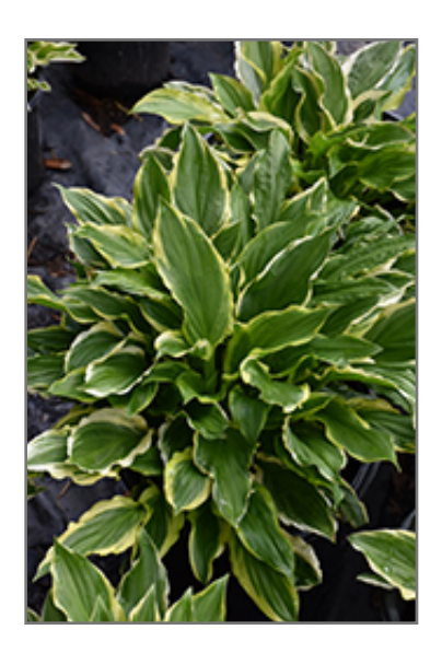
SunHosta Hosta

SunHosta Hosta is recommended for the following landscape applications;