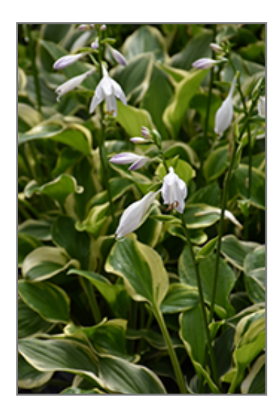
SunHosta Hosta flowers