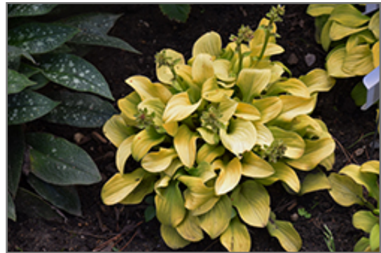
Sun Mouse Hosta

Sun Mouse Hosta is recommended for the following landscape applications;