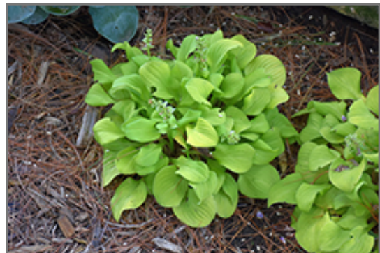
Sun Mouse Hosta