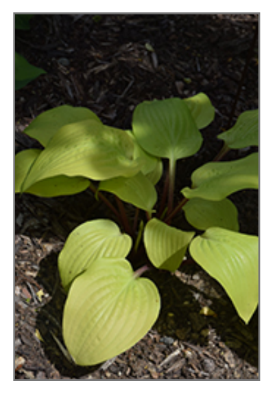
Rocket's Red Glare Hosta

Very glossy green leaves have rippled edges, and are accented with red petioles; interesting lavender flowers emerge in mid-summer on red scapes; provides beautiful texture and contrast to other plants