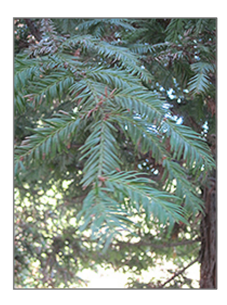
Aptos Blue Coast Redwood foliage

This tree does best in full sun to partial shade. It does best in average to evenly moist conditions, but will not tolerate standing water. It is not particular as to soil type, but has a definite preference for acidic soils. It is somewhat tolerant of urban pollution. This is a selection of a native North American species.