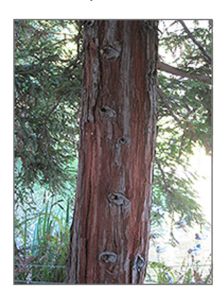
Aptos Blue Coast Redwood bark