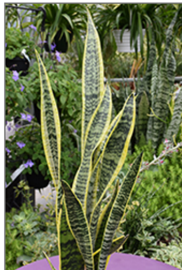
Striped Snake Plant foliage

This is an herbaceous evergreen houseplant with an upright spreading habit of growth. This plant may benefit from an occasional pruning to look its best.