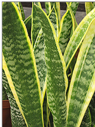
Striped Snake Plant foliage