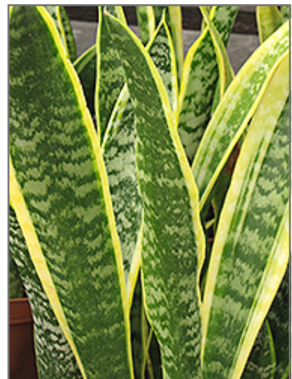
Striped Snake Plant foliage