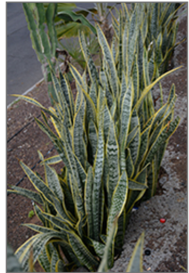
Striped Snake Plant

This plant is native to the tropics and prefers growing in moist environments with evenly warm conditions all year round. In our climate, it is usually grown as an outdoor annual in the garden or in a container. If you want it to survive the winter, it can be brought in to the house and provided with special care, and then returned to the garden the following season. In its preferred tropical habitat, it can grow to be around 4 feet tall at maturity, with a spread of 18 inches. However, when grown as an annual or when overwintered indoors, it can be expected to perform differently, and its exact height and spread will depend on many factors; you may wish to consult with our experts as to how it might perform in your specific application and growing conditions.