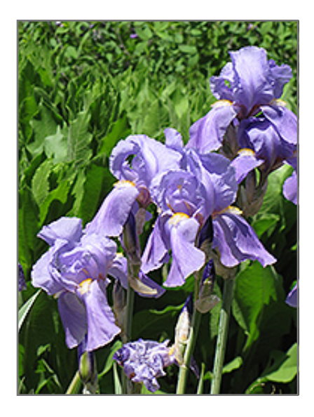
Golden Variegated Sweet Iris flowers Photo courtesy of NetPS Plant Finder

Golden Variegated Sweet Iris in bloom Photo courtesy of NetPS Plant Finder