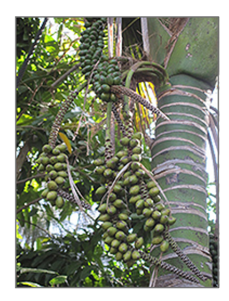
Kentia Palm fruit