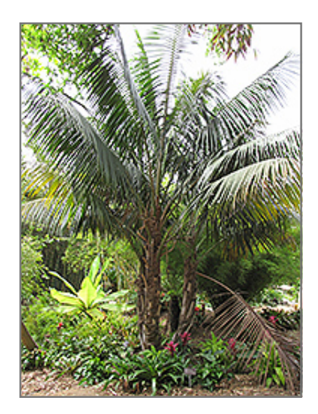
Kentia Palm

This tropical plant does best in full sun to partial shade. It is very adaptable to both dry and moist growing conditions, but will not tolerate any standing water. It is not particular as to soil pH, but grows best in rich soils, and is able to handle environmental salt. It is somewhat tolerant of urban pollution. This species is not originally from North America.