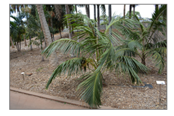
Kentia Palm

Kentia Palm is a fine choice for the yard, but it is also a good selection for planting in outdoor pots and containers. Because of its height, it is often used as a 'thriller' in the 'spiller-thriller-filler' container combination; plant it near the center of the pot, surrounded by smaller plants and those that spill over the edges. It is even sizeable enough that it can be grown alone in a suitable container. Note that when grown in a container, it may not perform exactly as indicated on the tag - this is to be expected. Also note that when growing plants in outdoor containers and baskets, they may require more frequent waterings than they would in the yard or garden. Be aware that in our climate, most plants cannot be expected to survive the winter if left in containers outdoors, and this plant is no exception. Contact our experts for more information on how to protect it over the winter months.