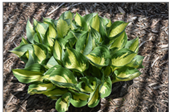
Morning Light Hosta