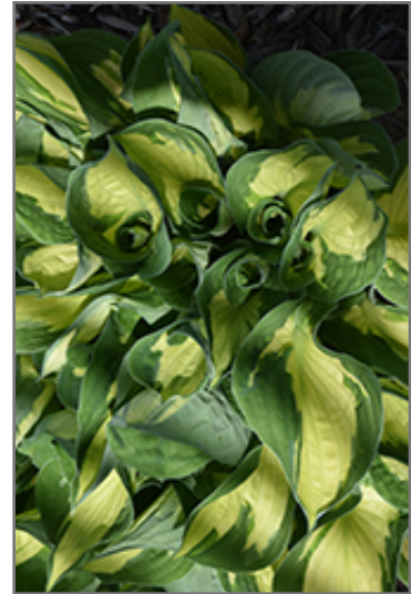
Morning Light Hosta foliage