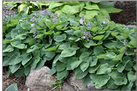
Heart Throb Hosta