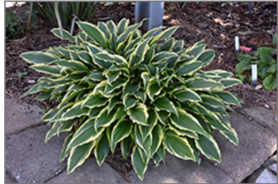
First Lady Hosta