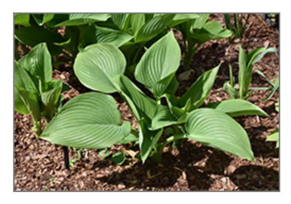
Elatior Hosta