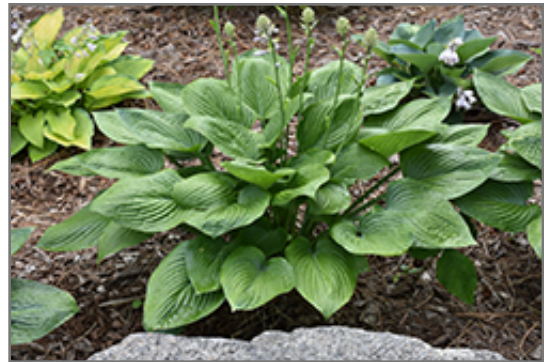
Blue Hawaii Hosta

Blue Hawaii Hosta is recommended for the following landscape applications;