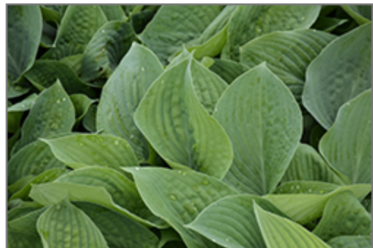
Blue Hawaii Hosta foliage