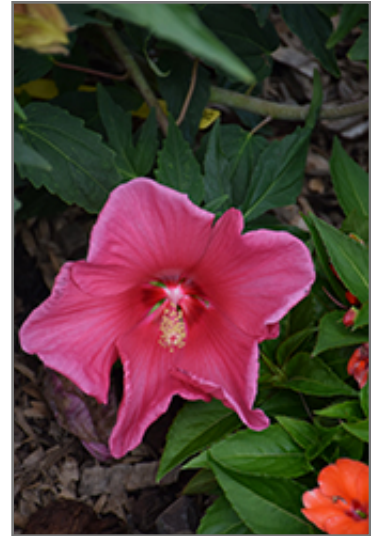
Summer Spice Crepe Suzette Hibiscus flowers