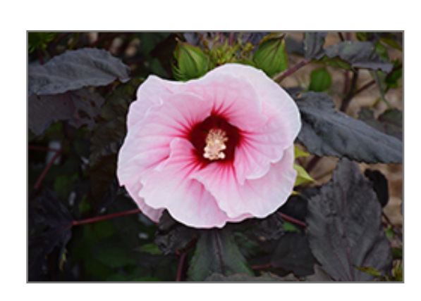
Carousel Pink Candy Hibiscus flowers

This sturdy and vigorous selection has a rounded upright shape and is covered with showy, huge, ruffled pink flowers; attractive, glossy leaves are deep burgundy; ideal for the mixed garden border or in mass; do not allow to dry to wilting point