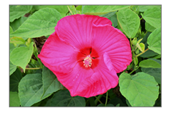
Honeymoon Rose Hibiscus flowers

Honeymoon Rose Hibiscus is recommended for the following landscape applications;