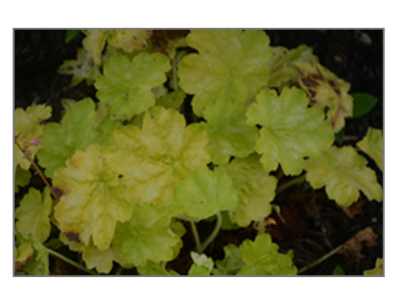
You're So Vein Coral Bells foliage

Dainty spikes of pink bells rise from a mound of chartreuse green foliage with a touch of silvering and overlaid with prominent bronze veins; amazing contrast to other plants, great versatility; keep soil moist in the heat of summer