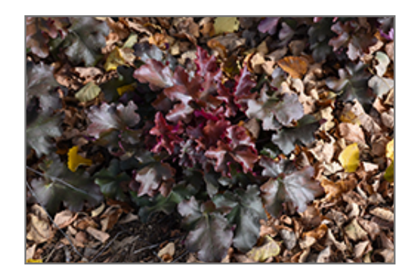
Red Sea Coral Bells