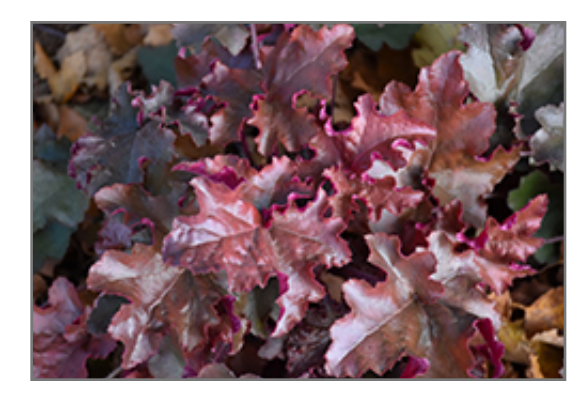
Red Sea Coral Bells foliage

Red Sea Coral Bells will grow to be about 12 inches tall at maturity extending to 16 inches tall with the flowers, with a spread of 16 inches. When grown in masses or used as a bedding plant, individual plants should be spaced approximately 14 inches apart. Its foliage tends to remain dense right to the ground, not requiring facer plants in front. It grows at a medium rate, and under ideal conditions can be expected to live for approximately 10 years. As an evegreen perennial, this plant will typically keep its form and foliage year-round.