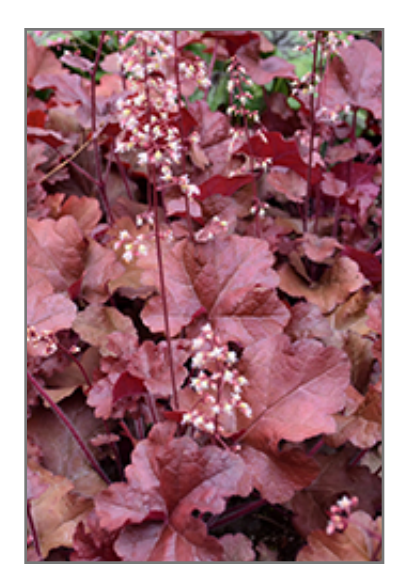
Red Sea Coral Bells flowers

This is a relatively low maintenance plant, and should be cut back in late fall in preparation for winter. It is a good choice for attracting hummingbirds to your yard, but is not particularly attractive to deer who tend to leave it alone in favor of tastier treats. It has no significant negative characteristics.