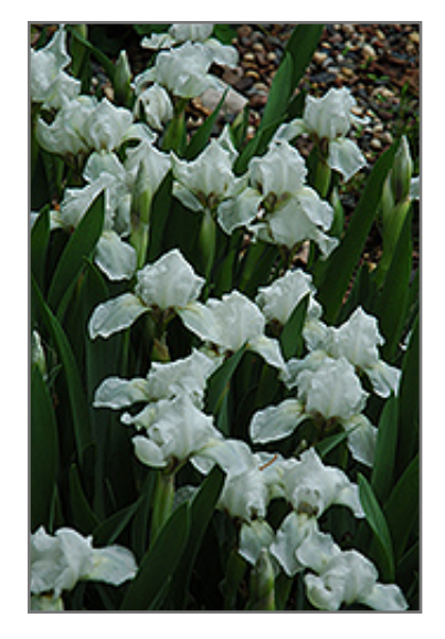
White Light Iris flowers

White Light Iris has masses of beautiful white flag-like flowers with tan throats and white falls at the ends of the stems in mid spring, which are most effective when planted in groupings. The flowers are excellent for cutting. Its sword-like leaves remain green in colour throughout the season.