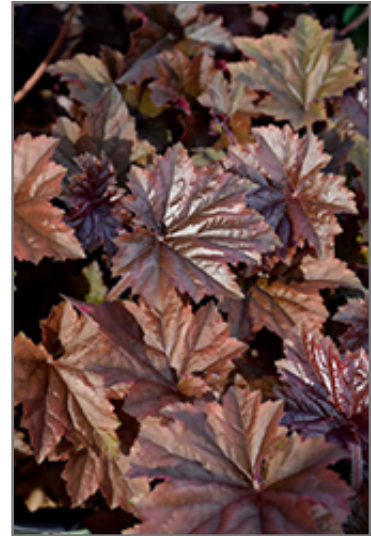
Bronze Wave Coral Bells foliage