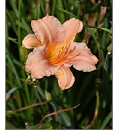
EveryDaylily Pink Wing Daylily flowers

This reblooming, dwarf daylily produces delightful pink and cream trumpets with dark pink halos and yellow throats; pretty ruffled blooms; sturdy, strong, easy to care for, with great grassy texture and form; perfect for containers, beds, and borders