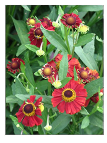
Red Jewel Sneezeweed flowers

Clusters of small, dusky red, daisy-like flowers with brownish-orange cones, irregularly tipped with yellow; begins to bloom towards the end of the season; plant in a moist area that is well drained and in full sun