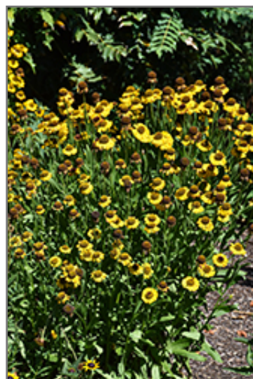
Salud Golden Sneezeweed in bloom