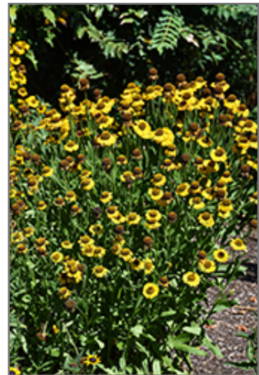
Salud Golden Sneezeweed in bloom