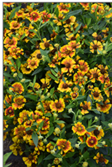
Salud Embers Sneezeweed flowers