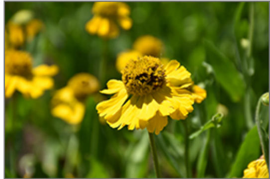
Pumilum Magnificum Sneezeweed flowers

This plant will require occasional maintenance and upkeep, and should be cut back in late fall in preparation for winter. It is a good choice for attracting butterflies to your yard, but is not particularly attractive to deer who tend to leave it alone in favor of tastier treats. Gardeners should be aware of the following characteristic(s) that may warrant special consideration;