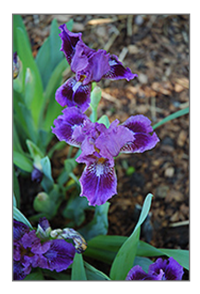
Tortuga Iris flowers

Tortuga Iris has masses of beautiful lilac purple flag-like flowers with purple overtones, yellow throats and a white beard at the ends of the stems in mid spring, which are most effective when planted in groupings. The flowers are excellent for cutting. Its sword-like leaves remain green in colour throughout the season.