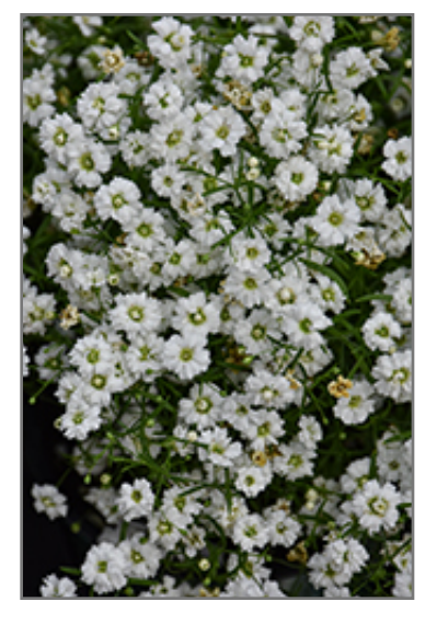
Gypsy White Baby's Breath flowers

This is a relatively low maintenance plant, and is best cleaned up in early spring before it resumes active growth for the season. It has no significant negative characteristics.