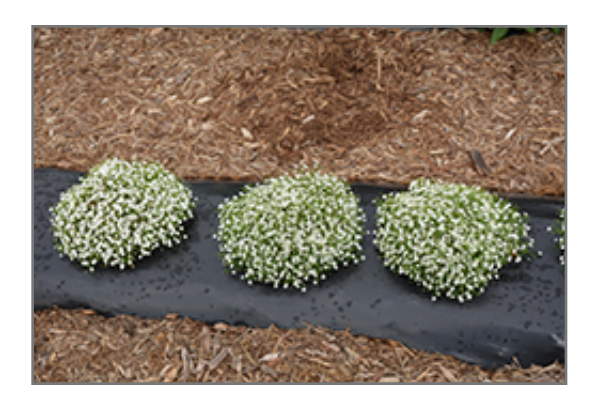
Gypsy White Baby's Breath in bloom

Gypsy White Baby's Breath is recommended for the following landscape applications;