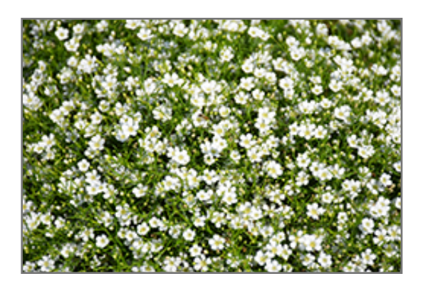
Gypsy Compact White Baby's Breath flowers

Gypsy Compact White Baby's Breath is an herbaceous perennial with a mounded form. It brings an extremely fine and delicate texture to the garden composition and should be used to full effect.