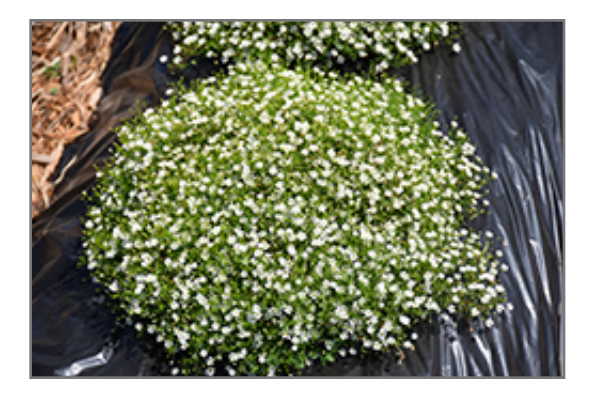
Gypsy Compact White Baby's Breath in bloom

This is a relatively low maintenance plant, and is best cleaned up in early spring before it resumes active growth for the season. It has no significant negative characteristics.