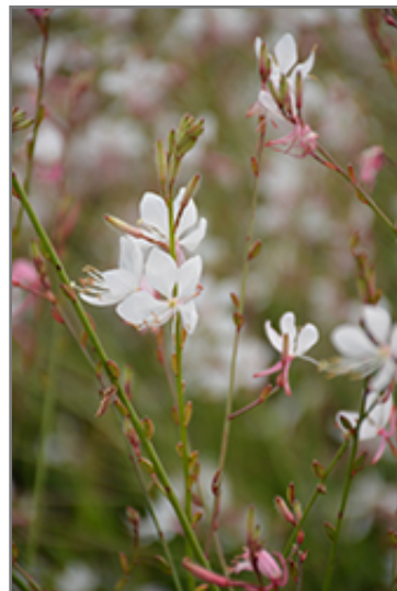
Summer Breeze Gaura flowers

Summer Breeze Gaura is recommended for the following landscape applications;