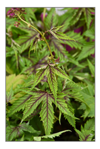
Red Umbrellas Meadowsweet foliage