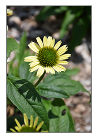
Mooodz Shiny Coneflower flowers