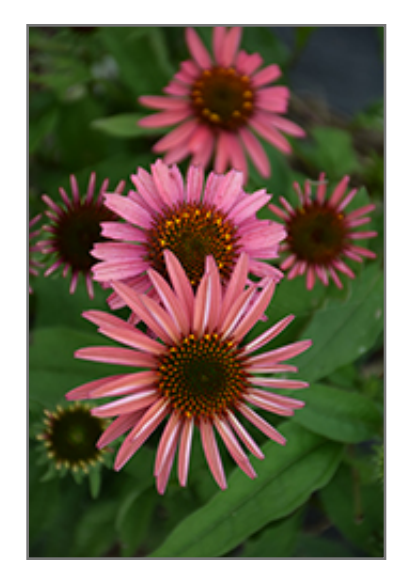
Mooodz Satisfy Coneflower flowers

This is a relatively low maintenance plant, and is best cleaned up in early spring before it resumes active growth for the season. It is a good choice for attracting butterflies to your yard, but is not particularly attractive to deer who tend to leave it alone in favor of tastier treats. It has no significant negative characteristics.