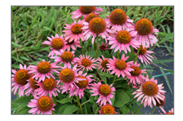
Mooodz Satisfy Coneflower flowers