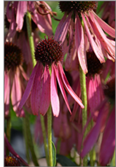
Rocket Man Coneflower flowers

Rocket Man Coneflower is recommended for the following landscape applications;