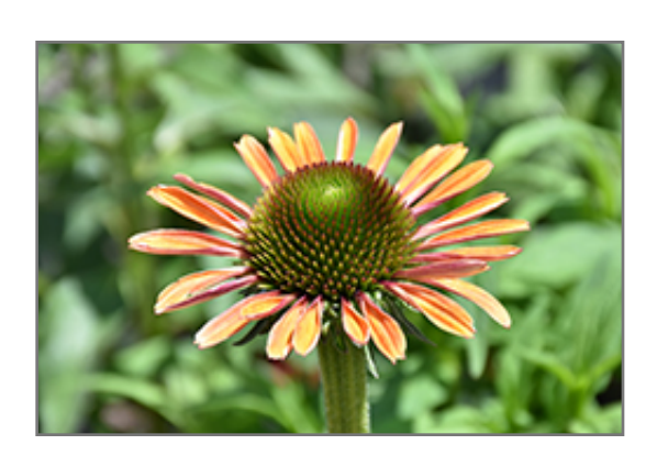
Butterfly Rainbow Marcella Coneflower flowers