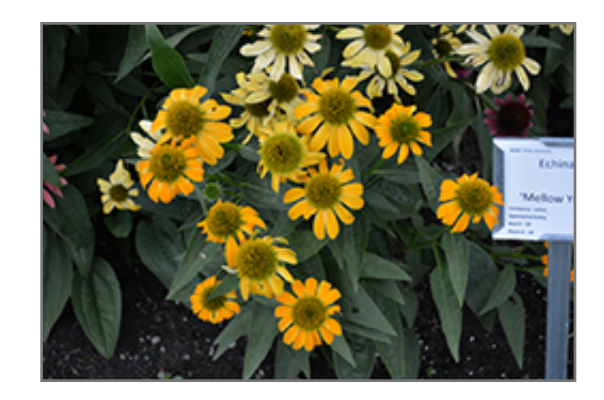
Mellow Yellows Coneflower flowers

Mellow Yellows Coneflower is recommended for the following landscape applications;