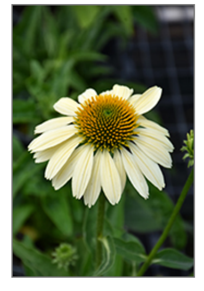
Mellow Yellows Coneflower flowers

This is a relatively low maintenance plant, and is best cleaned up in early spring before it resumes active growth for the season. It is a good choice for attracting birds and butterflies to your yard, but is not particularly attractive to deer who tend to leave it alone in favor of tastier treats. It has no significant negative characteristics.