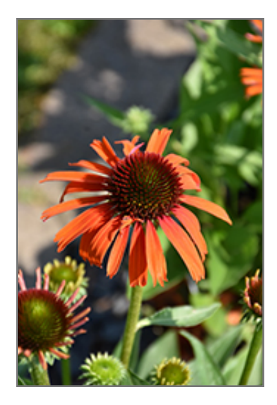
Butterfly Orange Skipper Coneflower flowers