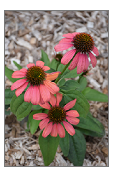
Mooodz Mediation Coneflower flowers

Mooodz Mediation Coneflower has masses of beautiful lightly-scented peach daisy flowers with pink overtones and orange eyes at the ends of the stems from early summer to early fall, which are most effective when planted in groupings. The flowers are excellent for cutting. Its pointy leaves remain green in colour throughout the season.