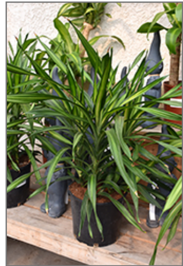
Rikki Dracaena in full

This is an herbaceous evergreen houseplant with an upright spreading habit of growth. Its relatively coarse texture stands it apart from other indoor plants with finer foliage. This plant may benefit from an occasional pruning to look its best.