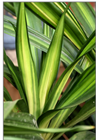
Rikki Dracaena foliage