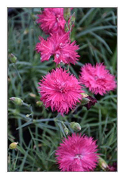
Pink Princess Carnation flowers

Semi-double, vivid pink carnations with fringed petal edges bloom consistently over a long season, especially in warmer climates; great for border fronts, containers, and floral arrangements