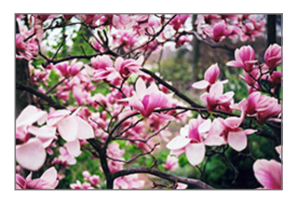
Forest Pink Saucer Magnolia flowers

A stunning small accent tree featuring spectacular cup-shaped and fragrant deep pink flowers in early spring before the leaves appear, large spreading habit of growth; more resistant to late spring frosts than other varieties