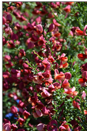
Sister Rosie Scotch Broom flowers