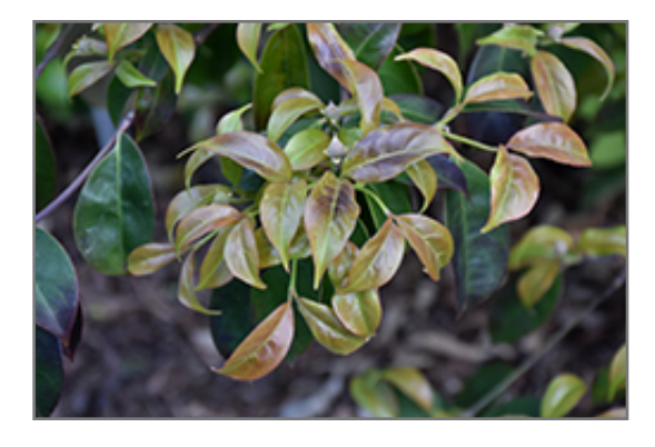
Moonshine Chinese Dogwood foliage