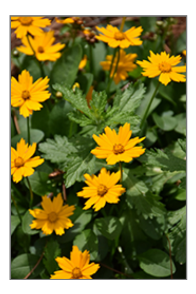
Autauga Gold Mouse-eared Tickseed flowers