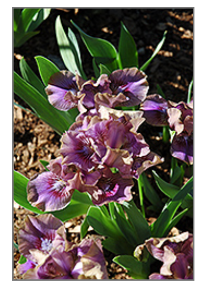
Serendipity Iris flowers

Serendipity Iris has masses of beautiful plum purple flag-like flowers with tan throats and fuchsia falls at the ends of the stems in mid spring, which are most effective when planted in groupings. The flowers are excellent for cutting. Its sword-like leaves remain green in colour throughout the season.