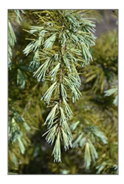
Cream Puff Deodar Cedar foliage