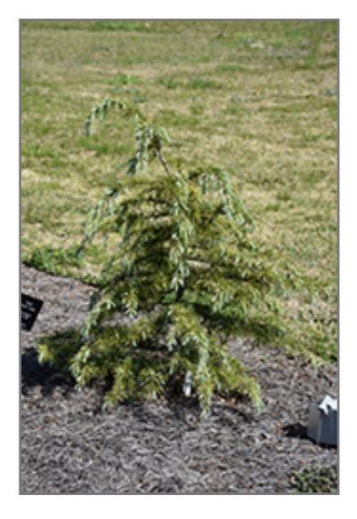
Cream Puff Deodar Cedar