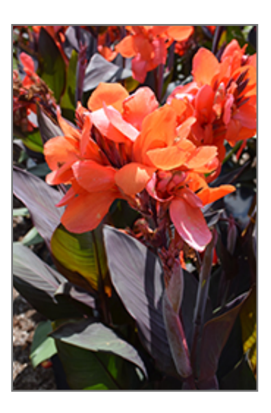
Cannova Bronze Orange Canna flowers

This plant is native to the tropics and prefers growing in moist environments with evenly warm conditions all year round. In our climate, it is usually grown as an outdoor annual in the garden or in a container. If you want it to survive the winter, it can be brought in to the house and provided with special care, and then returned to the garden the following season. In its preferred tropical habitat, it can grow to be around 4 feet tall at maturity, with a spread of 20 inches. However, when grown as an annual or when overwintered indoors, it can be expected to perform differently, and its exact height and spread will depend on many factors: you may wish to consult with our experts as to how it might perform in your specific application and growing conditions.