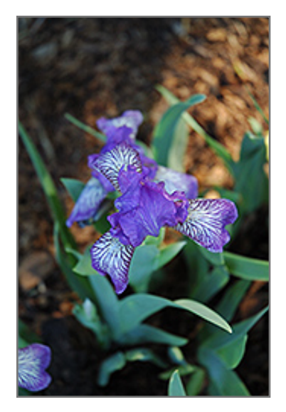
Scribe Iris flowers

Scribe Iris has masses of beautiful purple flag-like flowers with white veins at the ends of the stems in mid spring, which are most effective when planted in groupings. The flowers are excellent for cutting. Its small sword-like leaves remain green in colour throughout the season.