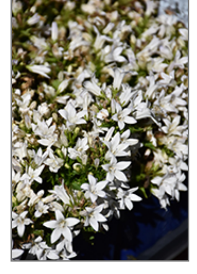
Ambella White Dalmatian Bellflower flowers

This showy dwarf species is perfect for rock gardens, edging, or in containers; loads of white bells begin in early summer and bloom for weeks; a very vigorous grower that is great as a small area groundcover